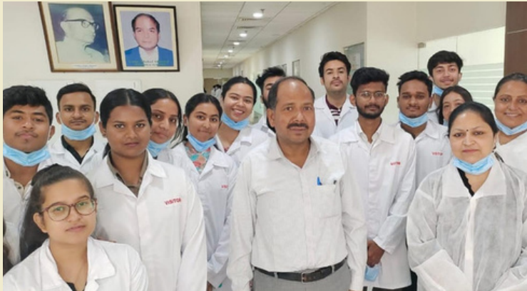
Industrial visit to Hamdard