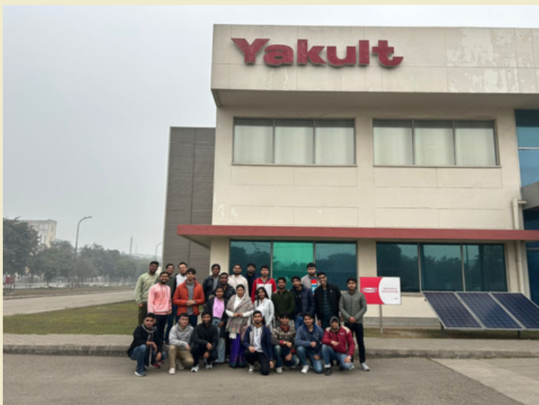
Industrial Visit to Yakult