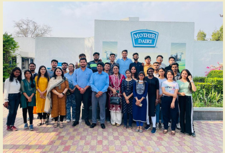
Industrial Visit to Mother Dairy